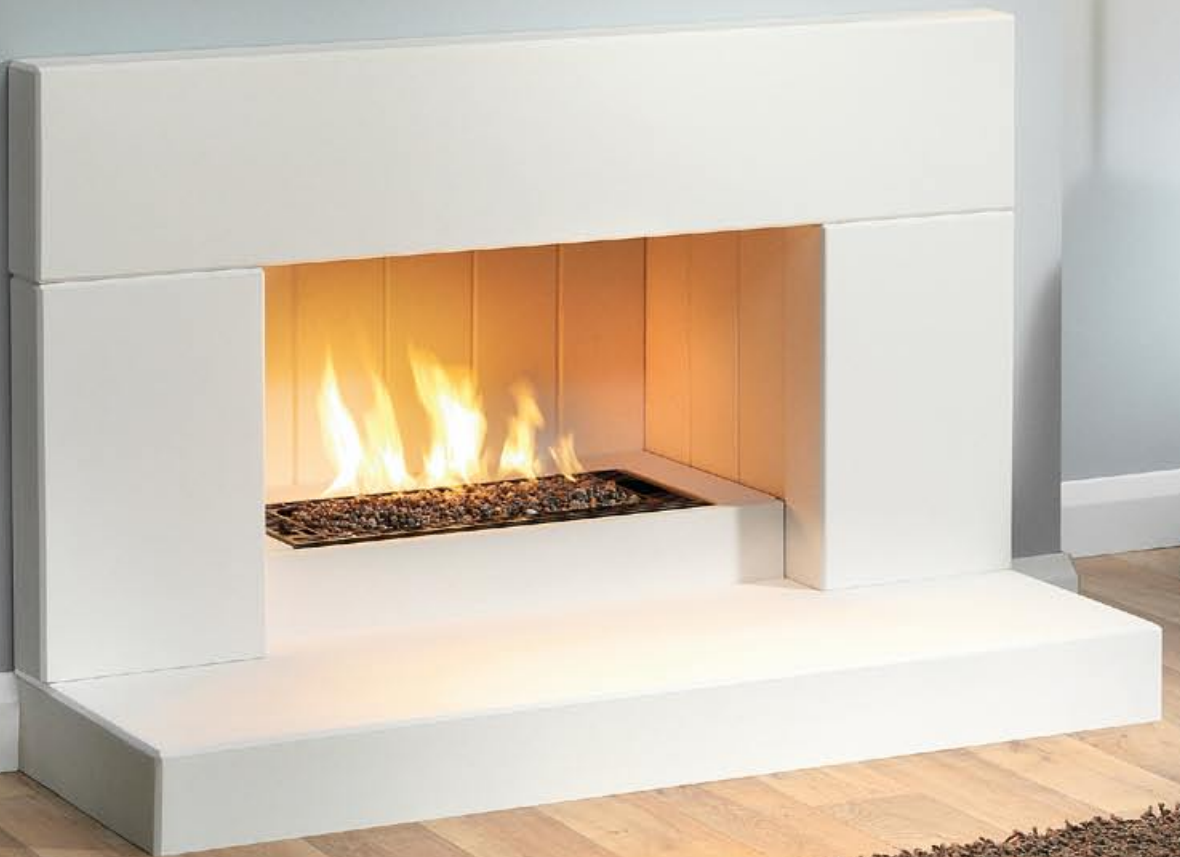
LS-26 LOW SUITE - AGEAN LIMESTONE remote control decorative gas fire with ceramic shingle