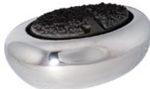
THE BOJI – Chrome finish