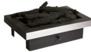
THE STRATA Chrome finish