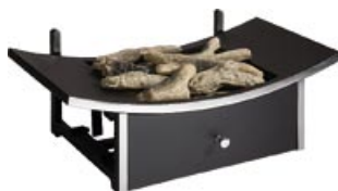
THE SIROCCO Highlight