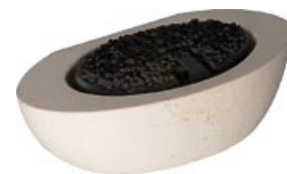
THE ORACLE – Agean Limestone