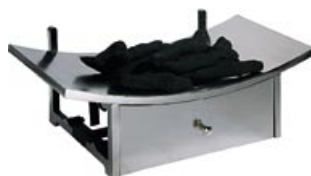
THE SIROCCO Full polished