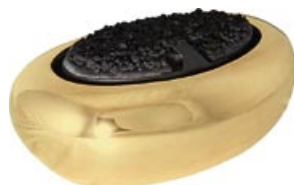
THE BOJI – Bronze finish