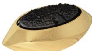
THE AKAL – Bronze finish