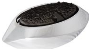
THE AKAL – Chrome finish