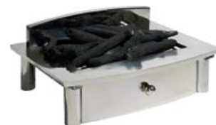
THE ZEN polished