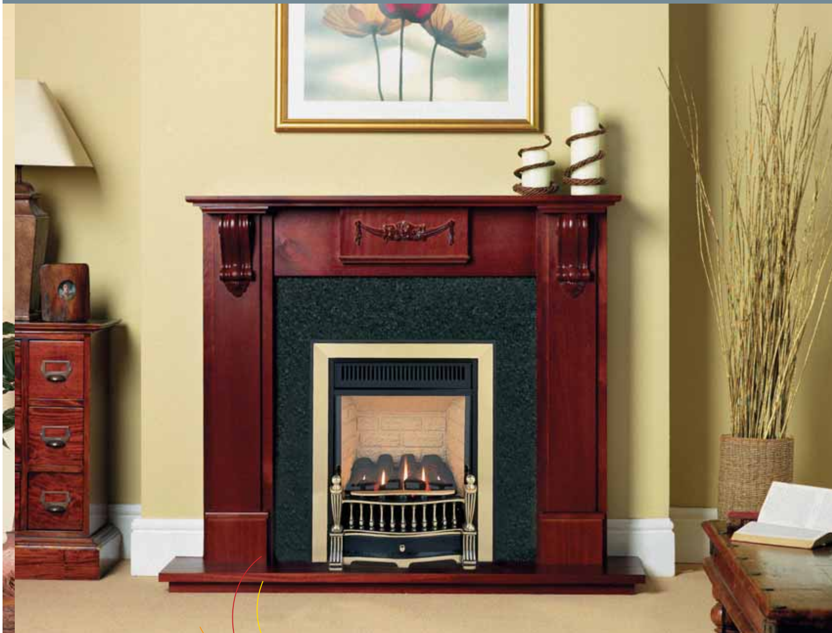
Environ 4240 fire shown with Kennet 722 surround in mahogany