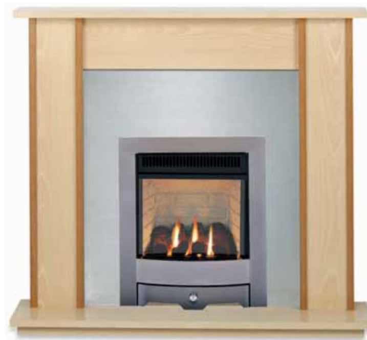
Environ 4247 fire shown with Helford 781 surround

Relax in the warmth of your Burley flueless fire, where all the gas is used to heat your room – not the environment. These fires feature advanced catalytic technology so no flue or chimney is required. Whilst conventional flued fires lose much of their heat up the chimney, Burley flueless gas fires boast 100% efficiency and therefore vastly reduced fuel costs.