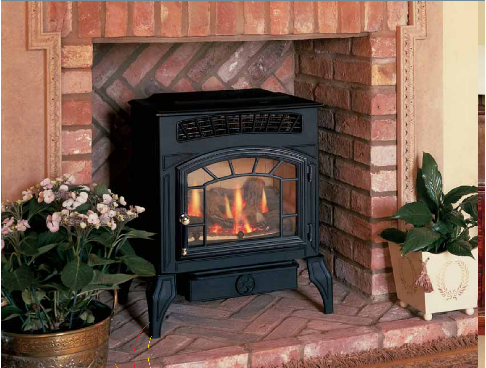
Ambience 4121stove. Natural gas.