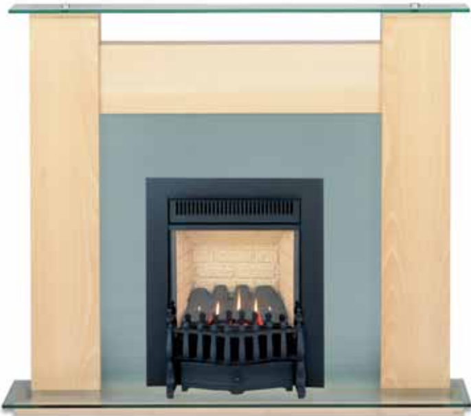
Environ 4244 fire shown with Hawkridge 783 surround