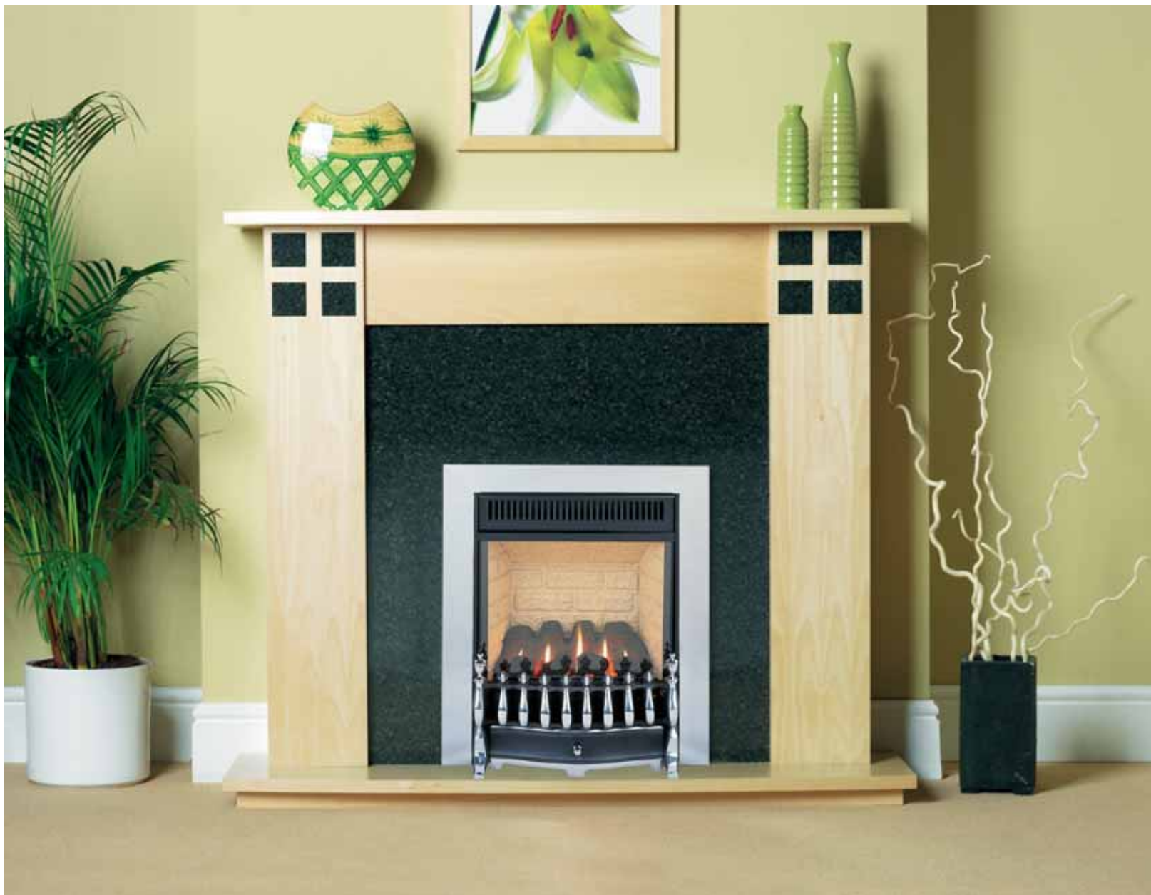
Environ 4242 fire shown with Tean 752 surround in natural beech

Relax in the warmth of your Burley flueless fire, where all the gas is used to heat your room – not the environment. These fires feature advanced catalytic technology so no flue or chimney is required. Whilst conventional flued fires lose much of their heat up the chimney, Burley flueless gas fires boast 100% efficiency and therefore vastly reduced fuel costs.