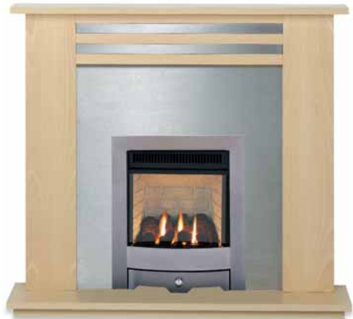
Environ 4247 fire shown with Torridge 787 surround