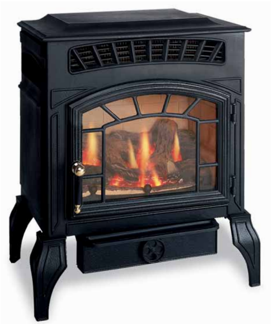
Ambience 4121 stove. Natural gas.

These handsome cast aluminium stoves have the classic good looks and homeliness of traditional wood stoves, but without the cost, inefficiency or mess of a chimney or flue.