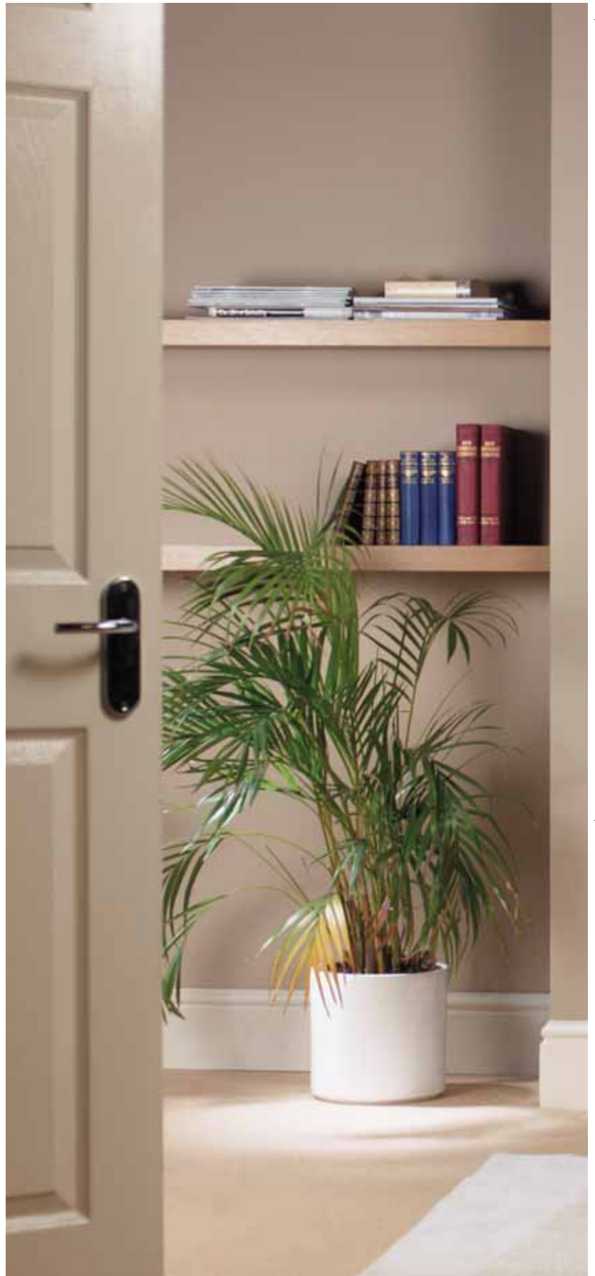
Elan 4111 fire shown with black chrome trim

The sleek styling of the Elan, hole-in-the-wall fire is enhanced by a realistic log bed and dramatic flame picture.