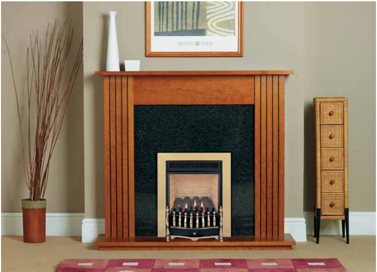
Environ 4248 fire shown with Hayle 753 surround in cherry