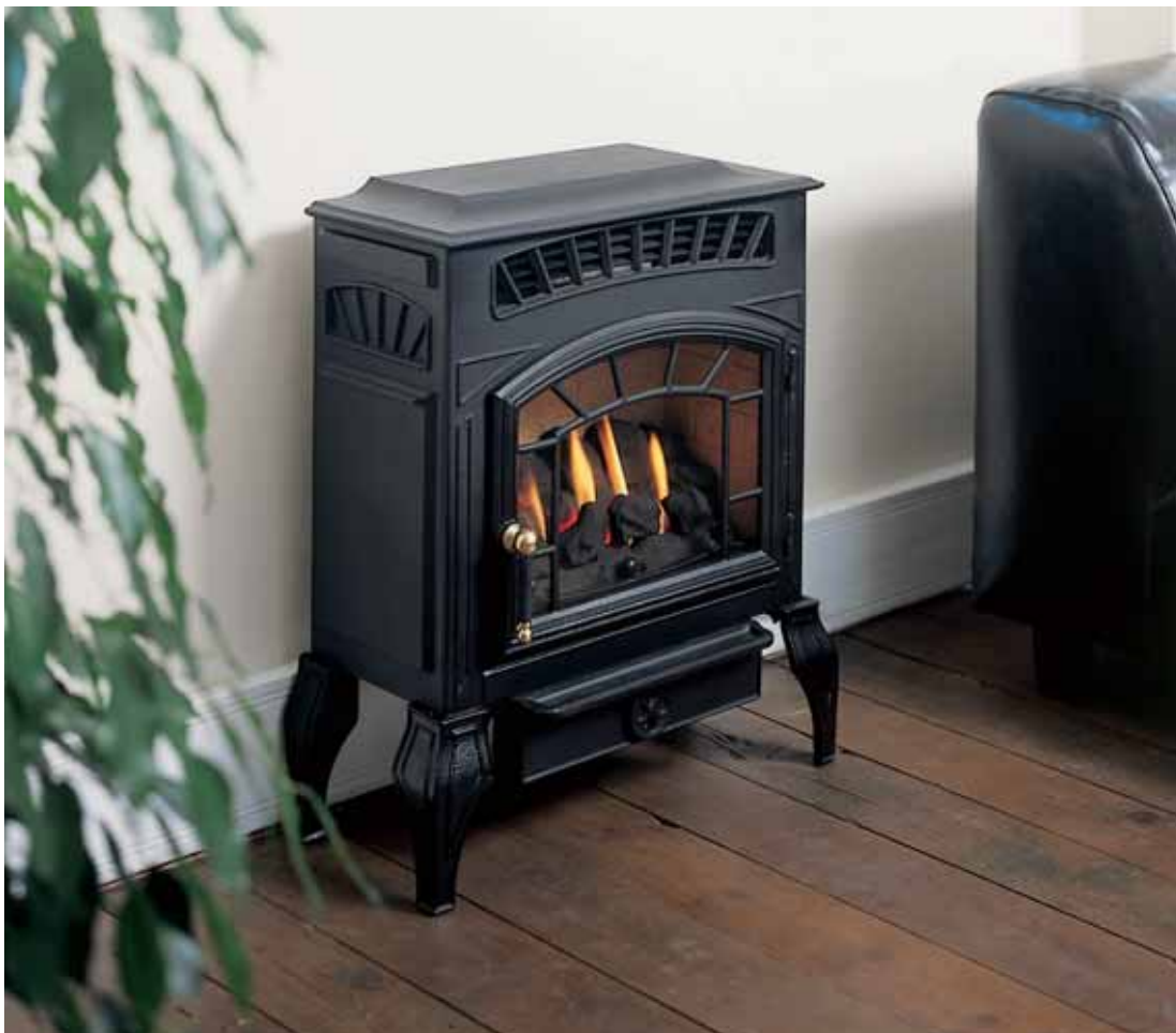
Esteem 4221 stove. Natural gas.