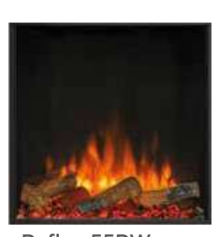
eReflex 55RW W: 555 x H: 555 x D: 175*