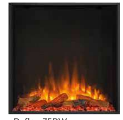
eReflex 75RW W: 755 x H: 755 x D: 175*