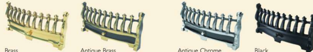
Brass Antique Brass Antique Chrome Black