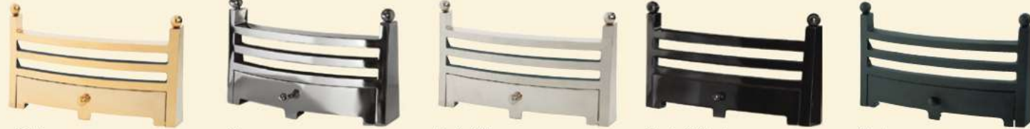
Gold Chrome Satin Silver Black Nickel Black