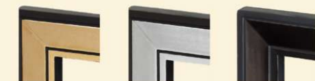
Gold & Black Chrome & Black Black Nickel & Black

The Ultimo is a cast iron trim with a black painted and optional colour plated finish. Suitable for all Verine hearth inset gas fires excluding Elypse BF. Unsuitable for Easy Flame Control systems.