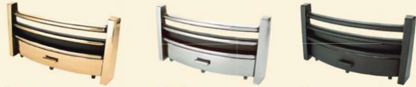
Brass Satin Silver Black