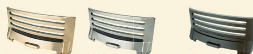
Brass Satin Silver Black