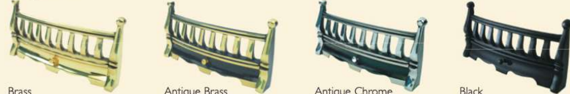
Brass Antique Brass Antique Chrome Black