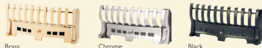
Brass Chrome Black