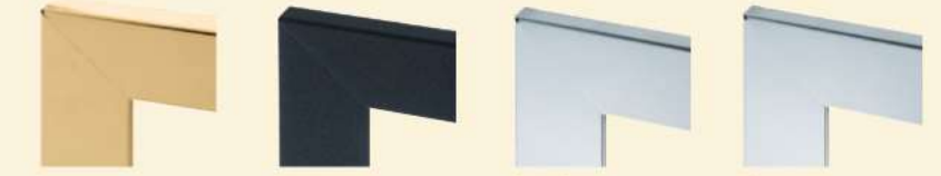
Brass Black Satin Silver Chrome

Quality steel trims in a choice of four colours with a plated or painted finish. This trim is suitable for all Verine hearth inset fires excluding the Elypse.