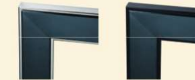
Black Nickel & Chrome Black Nickel & Black

The Signature is a quality steel fabricated trim in a range of metallic and paint finishes. Suitable for all Verine hearth inset gas fires excluding Elypse BF. Brass & Black finish is unsuitable for Alpena BF model.