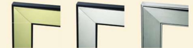
Brass & Black Chrome & Black Satin Silver & Chrome