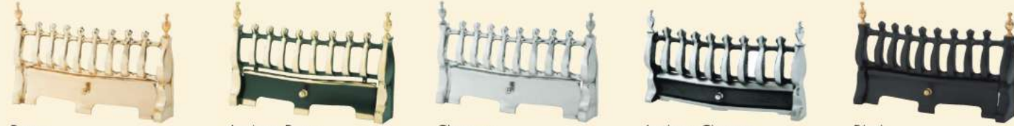
Brass Antique Brass Chrome Antique Chrome Black