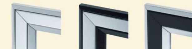
Chrome & Satin Silver Chrome & Black Black & Chrome

Made from extruded anodised aluminium, Designer trims create fabulous dual-coloured looks in a choice of three combinations. Suitable for all Verine hearth inset fires excluding the Elypse.