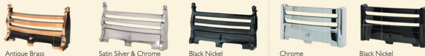
Antique Brass Satin Silver & Chrome Black Nickel Chrome Black Nickel