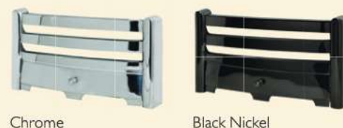
Chrome Black Nickel