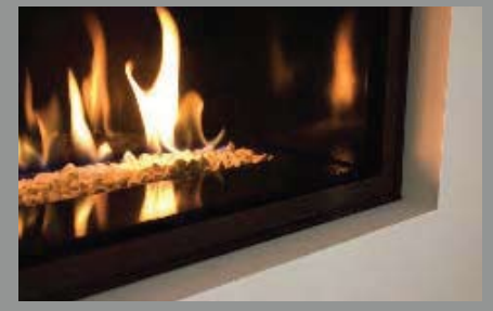
When using the Cool Wall Kit the fire is recessed by 60mm from the finished vall surface and the kit is left unfinished so that it can be painted to match rour decor.

NB: Full installation information, including the requirement for the use of noncombustible materials, can be downloaded from www.gazco.com