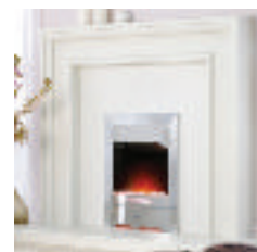
Electric fires 12-13