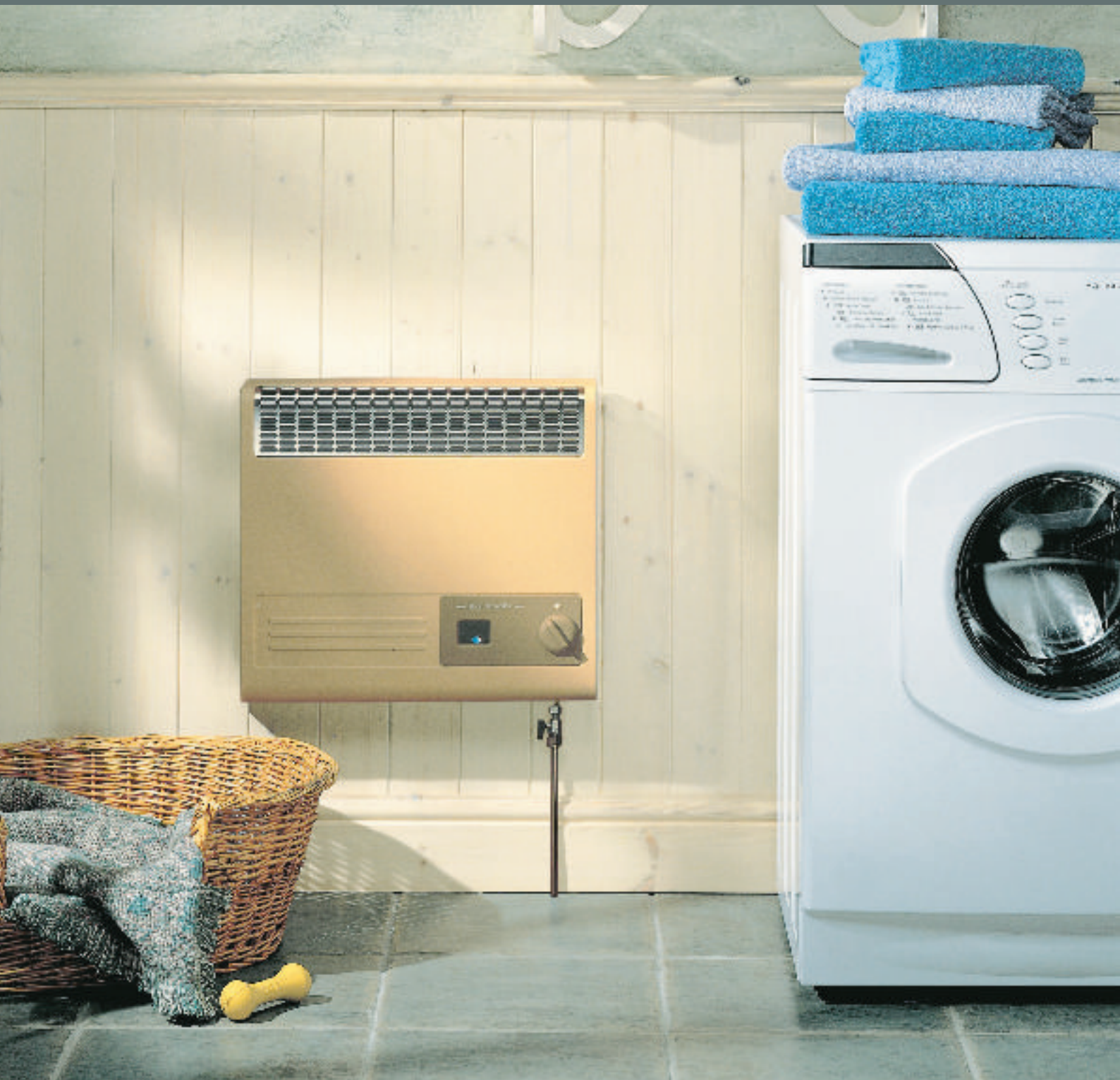
Brazilia F 5 in beige.