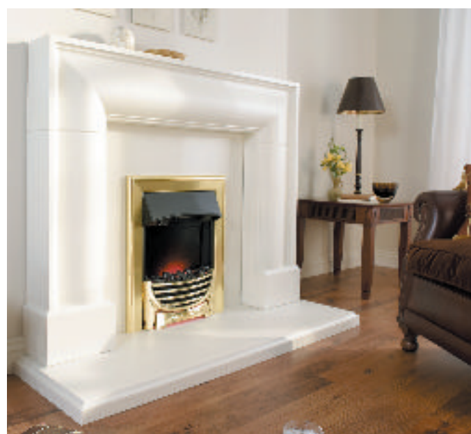
Right: Decadent electric in brass.