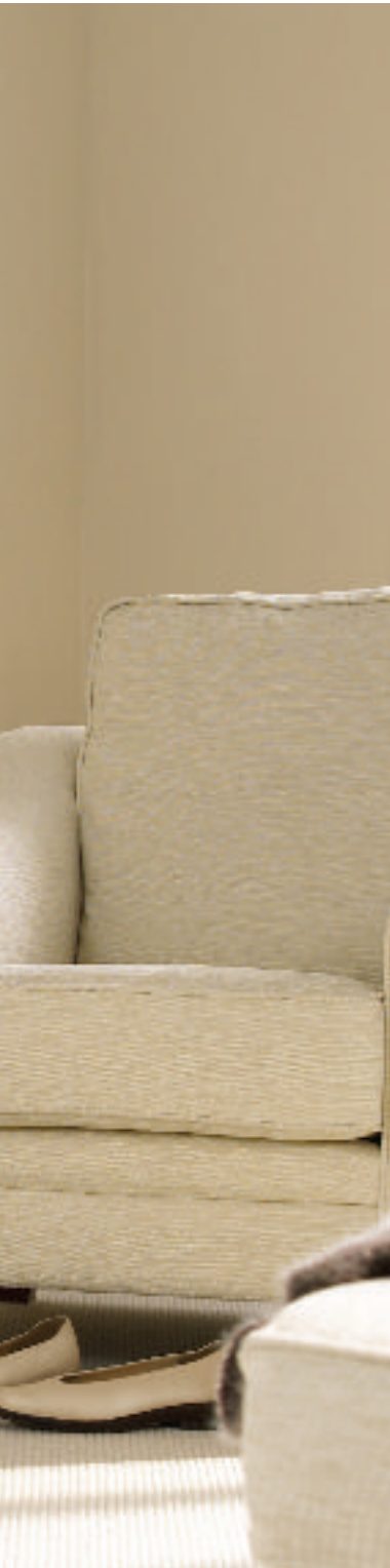
Decadent (with Slimline bed) in chrome.