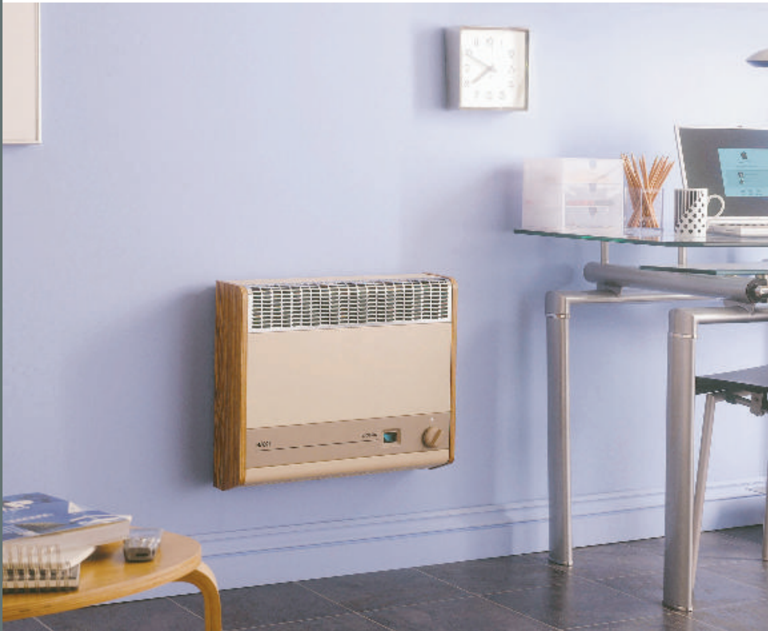
Brazilia F 8S in beige.