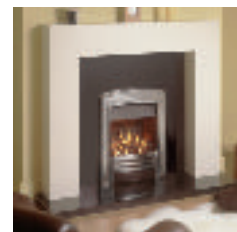
Inset fires 4-8