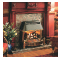
Outlet fires 9