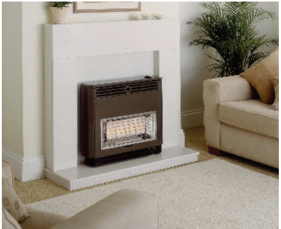
Top: Charm in mahogany. Bottom: Esquire in olive bronze.