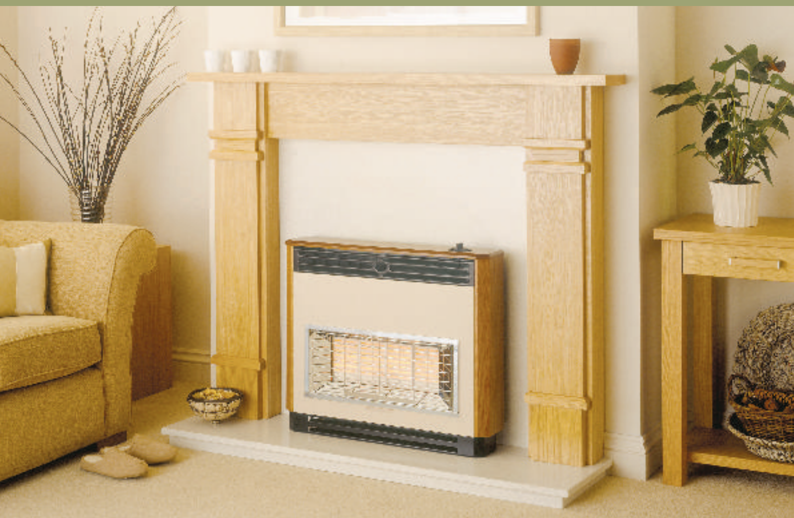
Brava in teak.

Our range of highly efficient radiant fires gives a superb level of performance - and every model is tremendously economical to run.