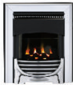
Decadent Balanced Flue in chrome.

Specially designed for homes without chimneys, our Decadent fire enables practically any home to enjoy the comfort and homely feel created by a gas fire.