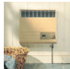
Wall heaters 16-18