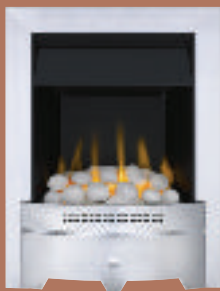
Minima (with slimline bed) in brushed chrome.