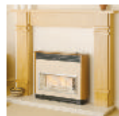
Radiant fires 10-11