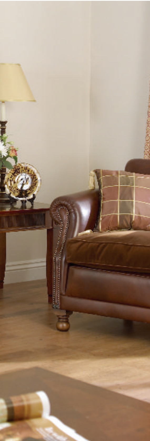
Decadent Balanced Flue in brass.