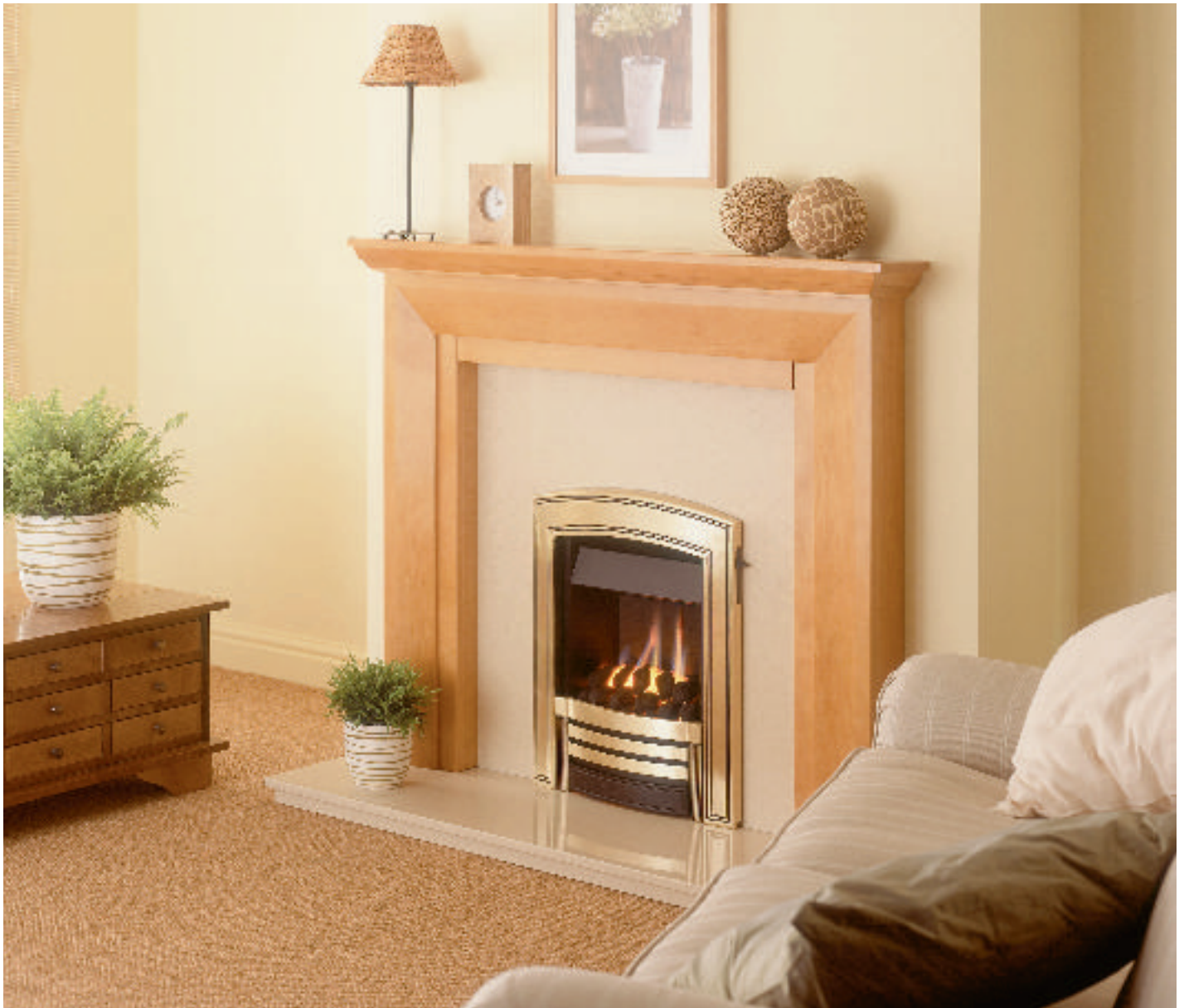
Above: Heritage (with Slimline bed) in gold . Right: Heritage (with deep bed) in silver.