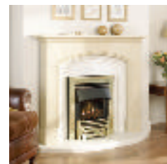
No chimney fires 14-15