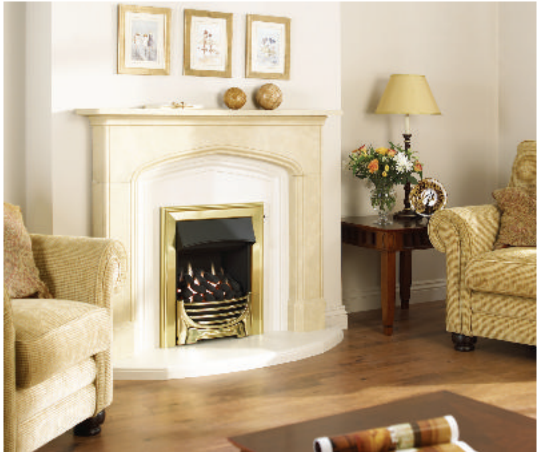
Decadent (with deep bed) in brass.