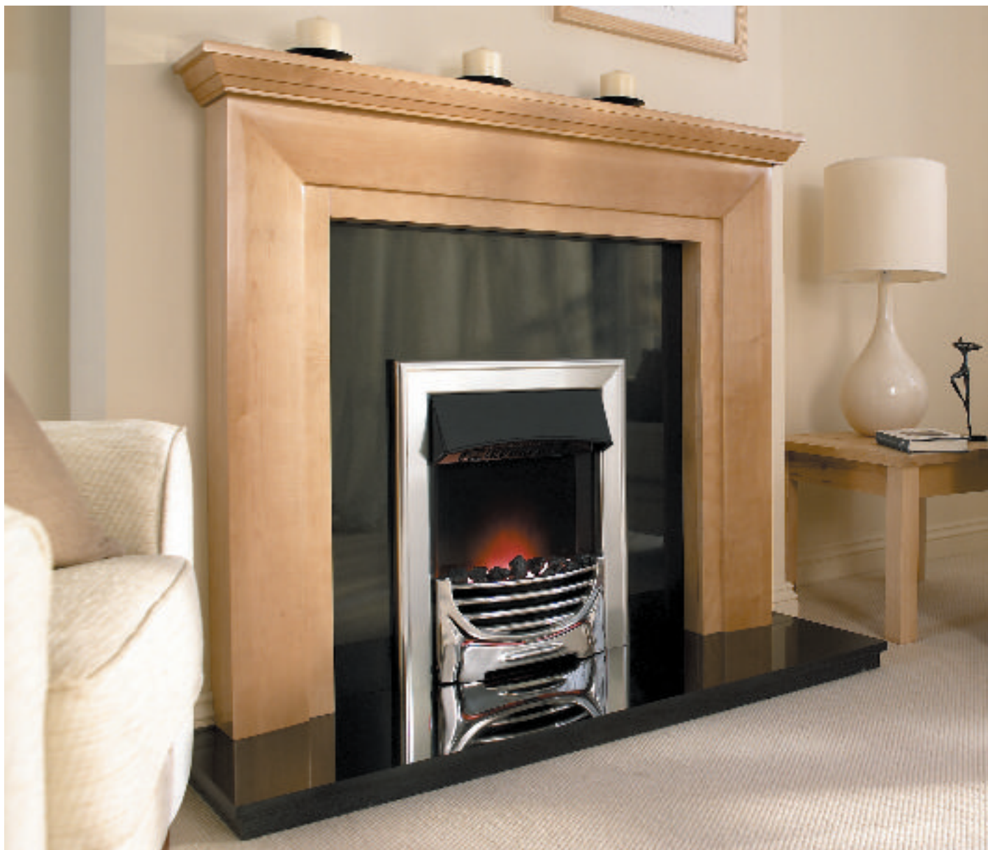
Above: Decadent electric in chrome.