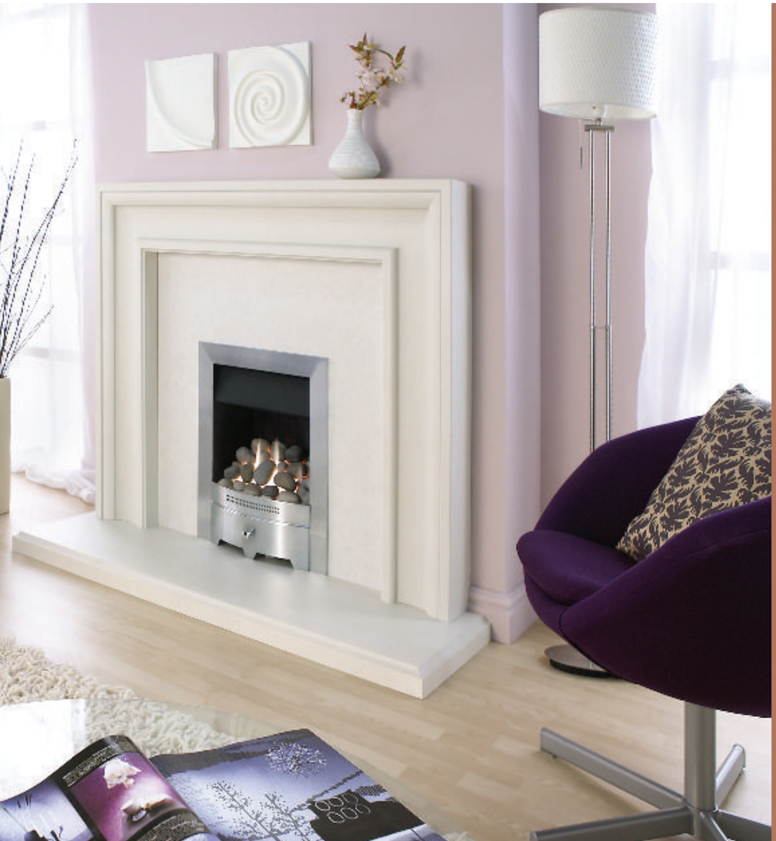
Minima (with deep bed) in brushed chrome.