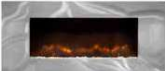
Satin trim 891