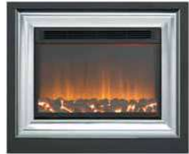
Whitwell 511-R + 811CH