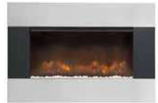
Contrast trim 876