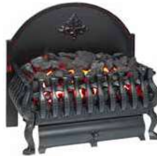
Cottesmore 224 BL