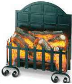
Lyddington Forge 101