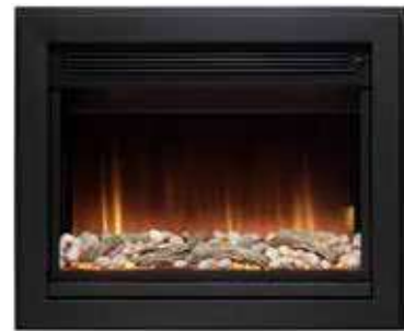
Whitwell 511-R + 811FBS