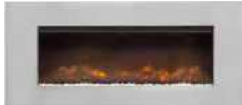
Orbital trim 892