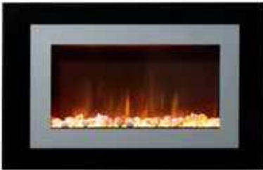
Ayston 515-S Glass Fascia