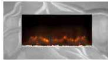
Satin trim 871