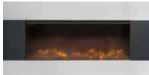
Contrast trim 896