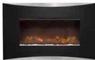
Casterton trim 873