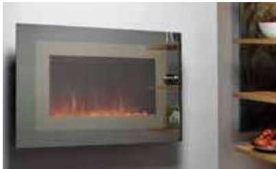
Ayston 515-S Mirror Fascia