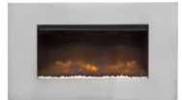
Orbital trim 872