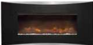
Casterton trim 893